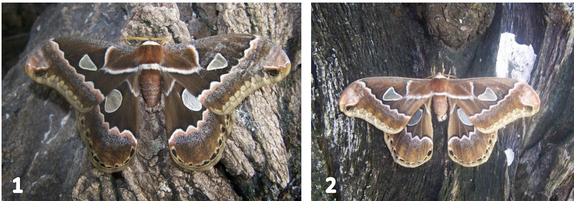
Figs. 1 – 2: Rothschildia maurus male specimens; 1) Estancia Braulia; 2) Puerto Galileo

The previously known distribution of R. maurus in Argentina and Bolivia was limited to the “low elevations on the eastern slopes of the Andes” (Lemaire, 1978). Surprisingly was the discovery of this species 700 km to the east along the Rio Paraguay valley. At both locations the observed and photographed specimens were males.