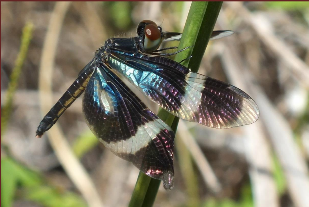
Zenithoptera viola Ris, 1910