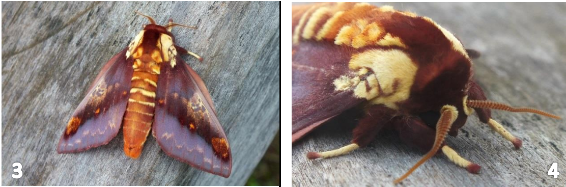
Figs. 3 – 4: Citheronia phoronea male specimen, Estancia Laguna Ciervo