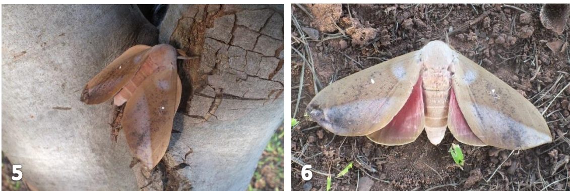
Figs. 5 – 6: Othorene hodeva male specimen, Estancia Laguna Ciervo

Distribution of this species reaches from the amazonian parts of Venezuela, Ecuador and Peru to Mato Grosso do Sul in Brazil (Lemaire, 1988). One male specimen was found on the edge of a dense forest patch of the Atlantic Forest type near the border to Brazil, the state of Mato Grosso do Sul. The landscape is covered by a mosaic of high forest, Cerrado and exotic pasture for cattle breeding. The highest individual density in Brazil is reached in primary forest (Hawes et. al., 2009).