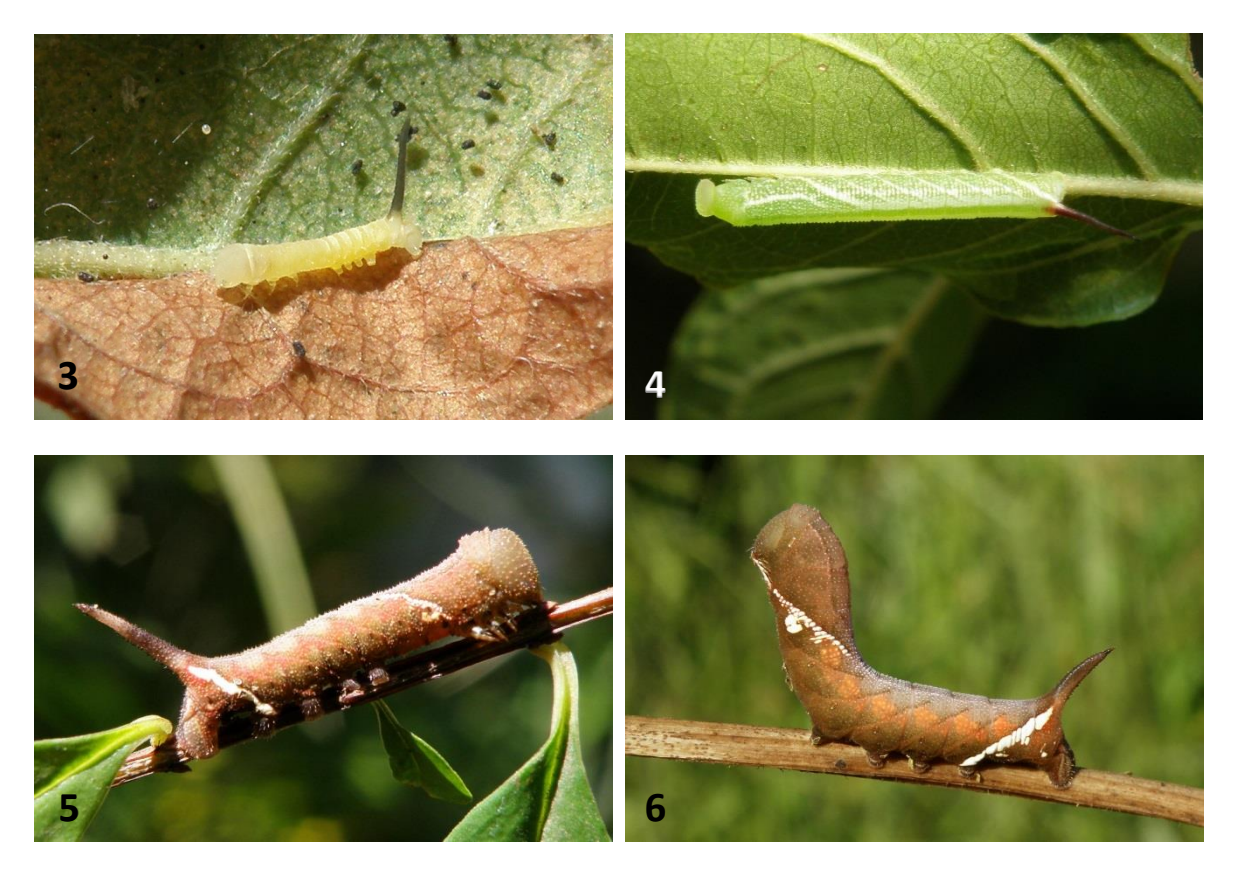
Figs: 3-6: Aellopos clavipes larvae; 3) first instar; 4) second instar; 5) third instar; 6) fourth instar

visible and abdominal spiracles are noticeable as dark spots (fig. 5). Duration of the third instar 4 days.