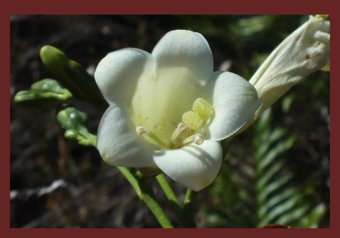
Chelonanthus viridiflorus (Mart.) Gilg