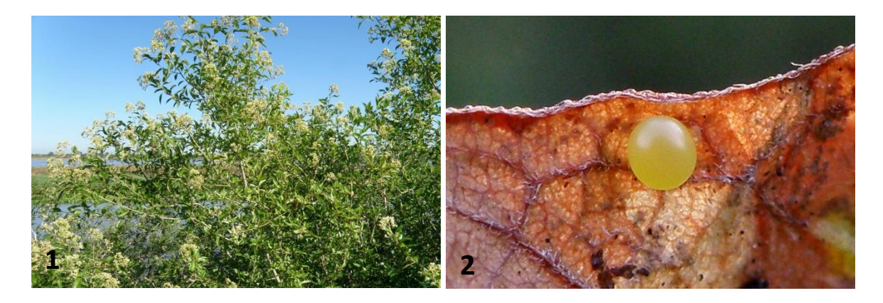
Figs: 1-2: Aellopos clavipes; 1) hostplant Machaonia brasiliensis; 2) ovum

Ovum: The egg is round, hardly noticeable oval and flattened dorsoventral (fig. 2). The largest diameter is 1.8 mm.