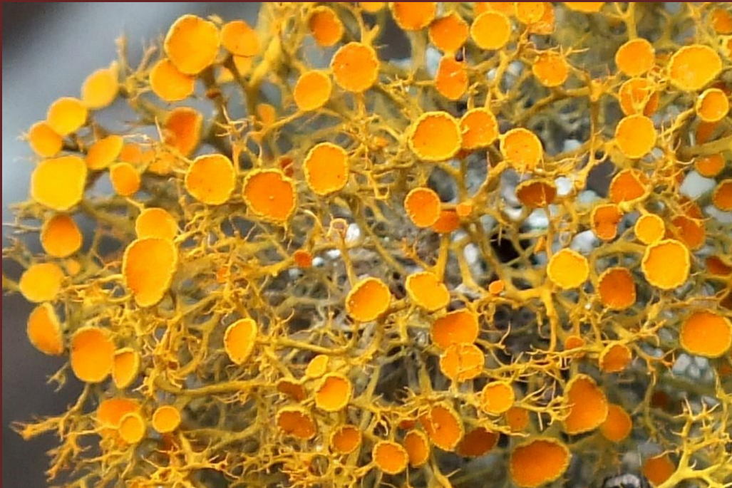
Teloschistes exilis (Michaux) Vainio