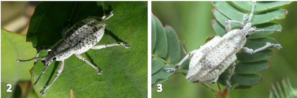
Figs: 2 – 3: O. argentinus 1) Estancia Lomas, 10. IV. 2009, 2) Estancia Tendota, 21. XII. 2013

Previously known from Argentina. The localities in Paraguay west of 57 ° length indicate a widespread distribution in the Chaco. Host plants could be Prosopis species, twice specimens were found on P. nigra and P. ruscifolia .