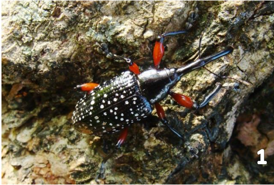
Fig. 1: H. germari , Colonia Neufeld, 26° 27' S 55° 55' W, 24. X. 2008.

Previously known distribution: Brazil, Uruguay and Argentina.